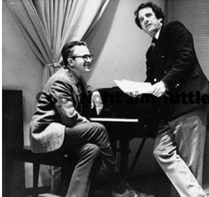
Lejaren Hiller and Lukas Foss, November 1970 Music Department Photograph Collection MD03-039

Beginning around 1956 Foss began to explore ways of incorporating elements of improvisation into his music. He established the Improvisation Chamber Ensemble at UCLA in 1957 to advance his ideas. He also began using indeterminacy in some of his works as well as employing graphic notation to express them. Paradigm , written in 1968, is an example of Foss's use of chance and improvisation.