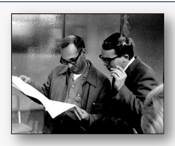
George Crumb and Buell Neidlinger MD02-037