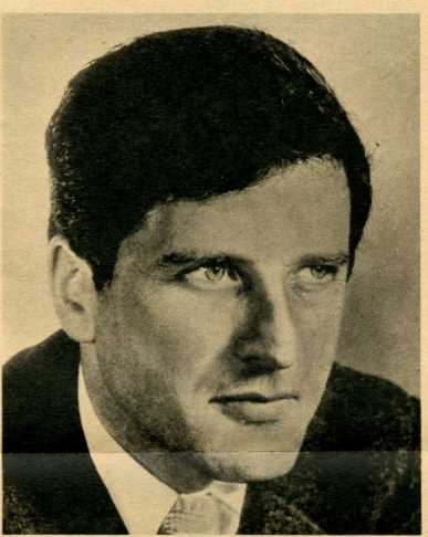
Buffalo's Lukas Foss

remained at a high level and even possibly gained in vitality within a basically classical approach. The limitations which suggest a lack of breadth—even in the new music field, for example, there is so far very little between some early and established 20th century classics and the latter-day avant-garde machines—can undoubtedly be easily superseded by a man of Foss' brilliance and ability. In any case, his position is a unique one, because he is the only example of an avant-garde composer occupying a major American podium, and because he continues to maintain his